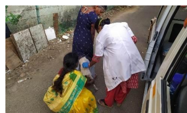
The Veterinary Surgeon, AWBI engaged in on the spot treatment of street / pet animals in remote areas of Chennai