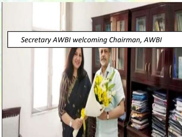
Secretary AWBI welcoming Chairman, AWBI

He is highly qualified environmental engineer turned as most dedicated and committed bureaucrat with passion for environmental conservation and sustainable development. He has very brilliant track record during his past services as well as academic excellence in higher studies from top Institutions in the country including M. Tech from IIT Roorkee, One Year General Management Programme (Executive) from IIM Lucknow and also obtained Doctorate Degree in Financial