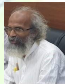
Shri Pratap Chandra Sarangi Hon'ble Minister of State, MFAH&D