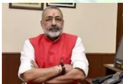
Shri Giriraj Singh Hon'ble Minister, MFAH&D

The administrative Ministry of Animal Welfare Board of India was changed from Ministry of Environment, Forest and Climate Change to the Ministry of Agriculture and Farmers' Welfare vide Gazette Notification No. S.O.1531(E) dated 04.04.2019 under Government of India (Allocation of Business) Rules 1961. Subsequently after formation of new Government, in May, 2019 new Ministry for Fisheries, Animal Husbandry and Dairying, Department of Animal Husbandry and Dairying has been created. The administrative Ministry of the Board has been changed to Fisheries, Animal Husbandry and Dairying Ministry with Hon'ble Minister for Fisheries, Animal Husbandry and Dairying Shri Giriraj Singh and Hon'ble Ministers of State Dr. Sanjeev Balyan and Shri Pratap Chandra Sarangi. The Board is working under the aegis of the new Ministry.