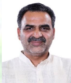
Dr. Sanjeev Balyan Hon'ble Minister of State, MFAH&D