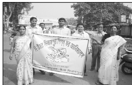
उत्तर दिनाजपुर पीएफएम (पश्चिम बंगाल) ने स्थानीय नगरों में लोगों में जागरूकता के लिए जागरूकता अभियान का आयोजन किया।