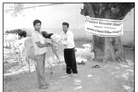
पिंजरापोल संस्थे (गौशाला) बागलकोट (कर्नाटक) ने पशु चिकित्सा स्वास्थ्य शिविर का आयोजन किया।