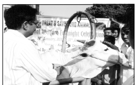
पार्वती परमेश्वरी एन्वायरमेंटल एनिमल वेलफेयर सोसाइटी, कर्नूल (आंध्र प्रदेश) ने टीकाकरण शिविर का आयोजन किया।